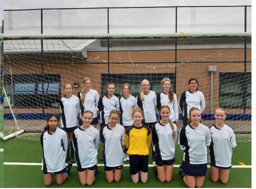
Y8+Y9 v Parker: Cup Game 2-1 win