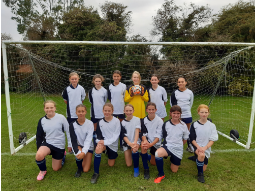
Y7 v Moulton: Cup Game 5-0 win

Sporting fixtures have been hugely successful this half term. Here are a few photos of some of the teams.