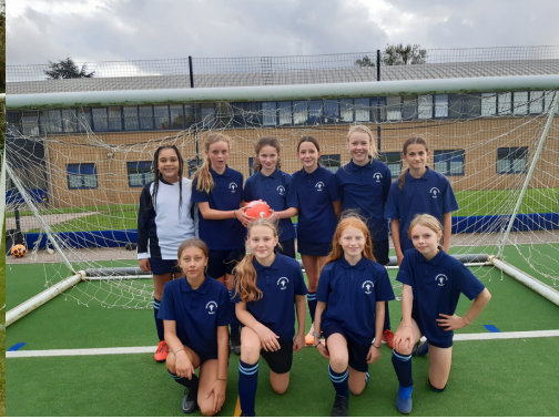
Y7 v Wykham